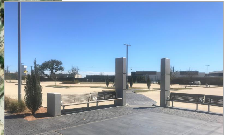
Parking lot behind restaurants, located directly across the street from 707 S. Floyd.